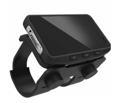
The CW45: A dedicated wearable mobile computer bringing optimized ergonomics and performance to arm-worn applications. Comfortable, powerful, compact, durable, and easy to use, the CW45 provides maximum solution return on investment.

Ultra-reliable performance, data connectivity, and communications for frontline mobile workers in warehouse/DC, retail, logistics, and manufacturing is always where it is needed, when it is needed. Designed from the ground up for comfort, ease of use, and reliability, the CW45 offers a low profile, large HD display, enterprise-level ruggedness, and comfortable, easy-to-wear accessories. The CW45 is designed for businesses that invest in sophisticated solutions and want a durable, stable, secure platform on which to implement them. Built on the newest generation of Honeywell's Mobility Edge™ platform, the CW45 delivers the lifecycle, security, and durability to optimize solution return on investment in the long term.