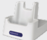
• 91ACC0073 Single Slot Cradle Charge only