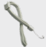
• 91ACC0036 Lanyard