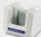
• 91ACC0072 Single Slot Cradle Locking